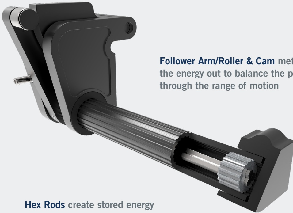
Hex Rods create stored energy

A counterbalance mechanism allows effortless positioning of a heavy panel or lid through the full range of motion when opening and closing.